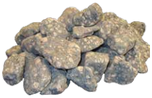
STAGE 8 Mineral Stones Replace after 5 years