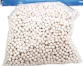
Alkalinity & Anti-Oxidant Enhancer (AAE)