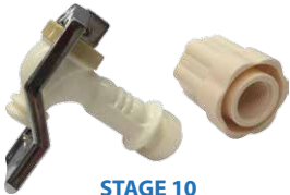
STAGE 10 Magnetic Tap

Water that is stagnant loses much of its life sustaining properties; the mineral stones combined with the silver stones in the bottom tank ensure the water is kept in a balanced healthy state.