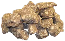
STAGE 9 Silver Stones Replace every 12 months